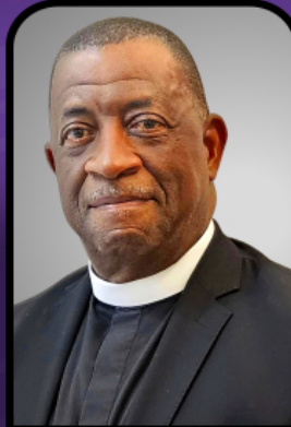
BISHOP TOMMY PHILLIPS